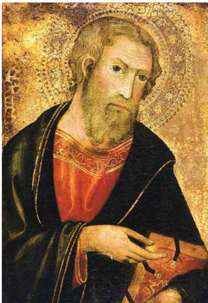
St. Paul, by Andrea di Bartolo

We, the community of St. Francis de Sales Parish, seek to LIVE JESUS through the empowerment of the Holy Spirit by ministering to the needs of our brothers and sisters through Word, Worship, Education and Service.