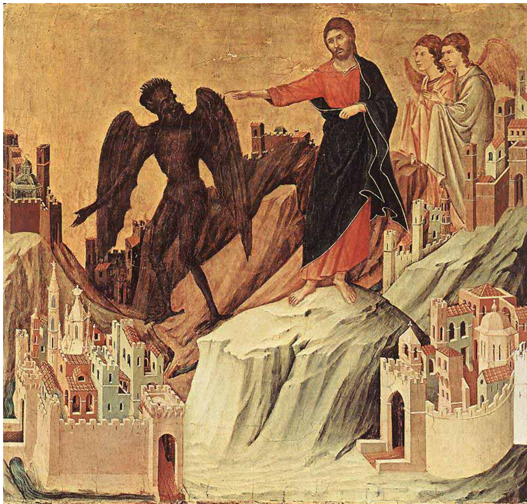
Temptation on the Mount, by Duccio di Buoninsegna, 1308-11

We, the community of St. Francis de Sales Parish, seek to LIVE JESUS through the empowerment of the Holy Spirit by ministering to the needs of our brothers and sisters through Word, Worship, Education and Service.