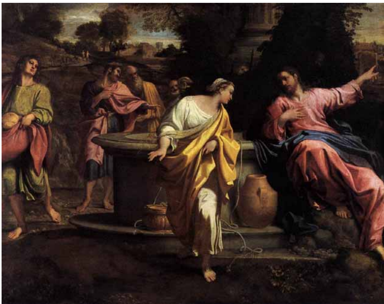
The Samaritan Woman at the Well, by Annibale Carracci

We, the community of St. Francis de Sales Parish, seek to LIVE JESUS through the empowerment of the Holy Spirit by ministering to the needs of our brothers and sisters through Word, Worship, Education and Service.